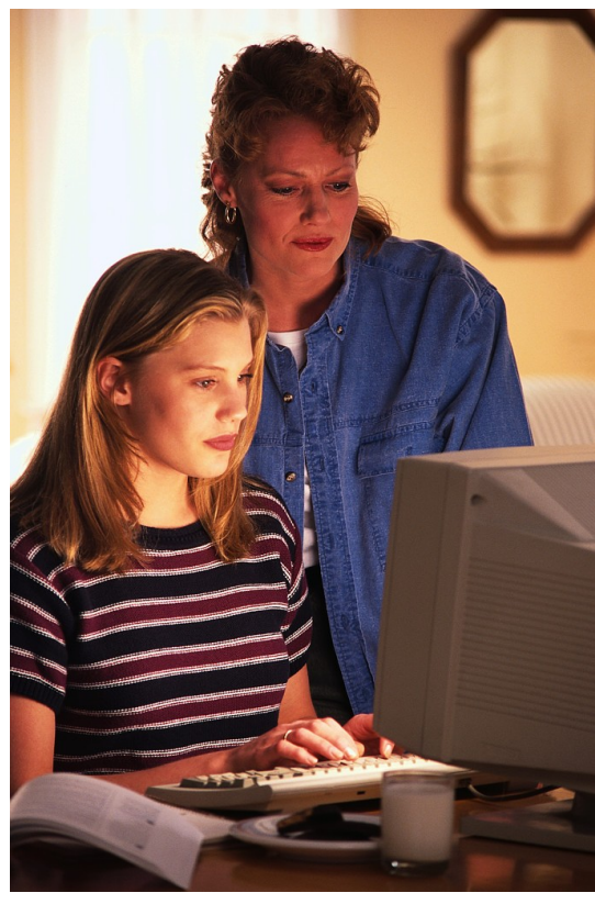
An academy where families can enjoy the benefits of being highly involved in their child's learning, while accessing the resources made available to all public school students in the State